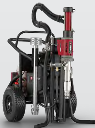
HYDRA X 4540

HYDRA X 7230 TO 4540 CONVERSION KIT 2432905A