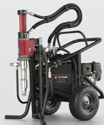
HYDRA X 7230