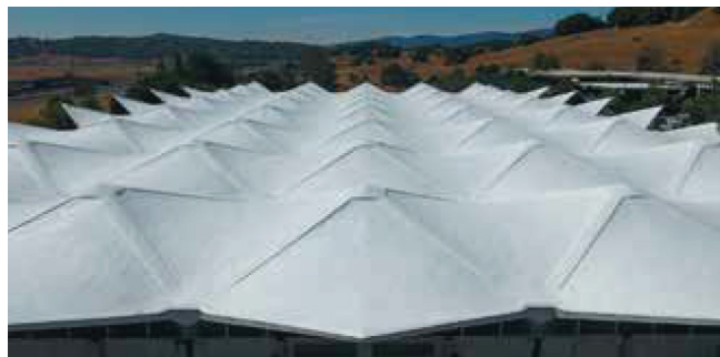
SPF roof installed over an unusual roof design at Birkenstock headquarters in Novato, CA.