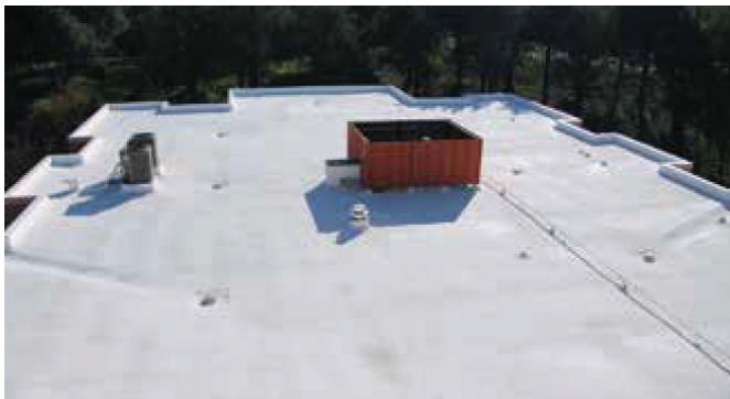
SPF roofing applied promotes enhanced drainage.