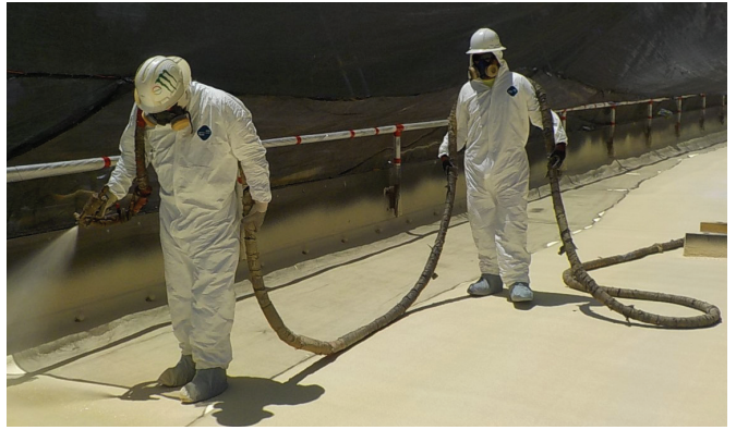
Application of SPF on a low-slope roof.

Elastomeric coatings are typically specified by the foam supplier as part of a SPF roof system and can include acrylic, silicone, butyl rubber, polyurethane and polyurea.