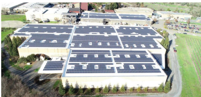
SPF roof with photovoltaic panels at the Rodney Strong Vineyards in Healdsburg, CA.