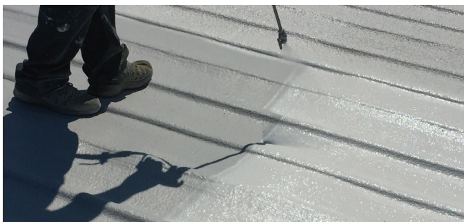
Application of SPF over a metal roof followed by an acrylic coating.