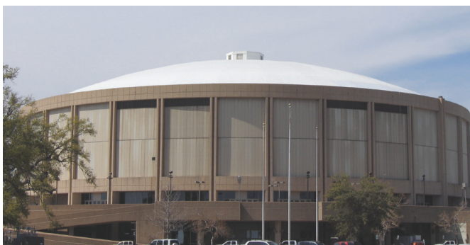
The SPF roof on the Biloxi (MS) Coliseum survived 12 hurricanes since 1979.